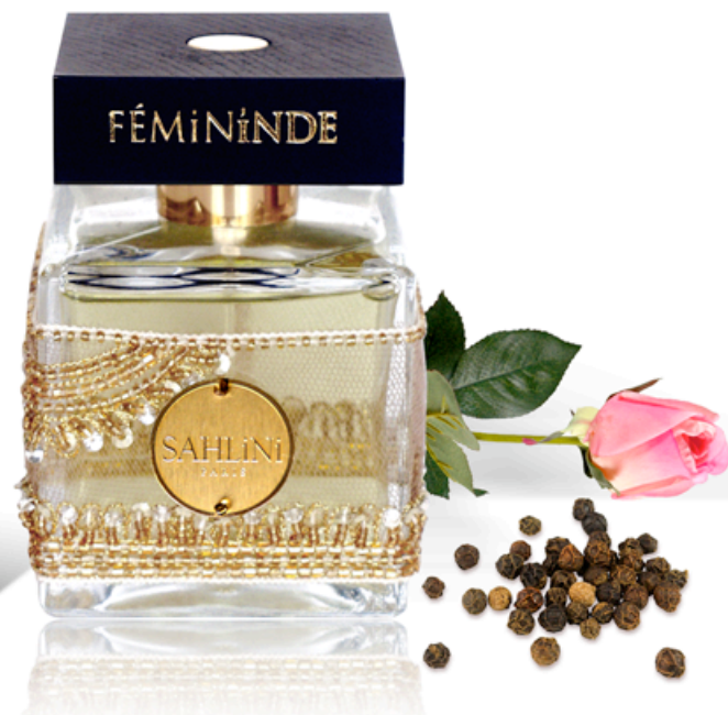
Photo gallery RGB (low res.) available on: www.sahliniparfums.com/press/galerieRVB

Download photos CMYB (High Res.) on: www.sahliniparfums.com/press/galerieCMJN